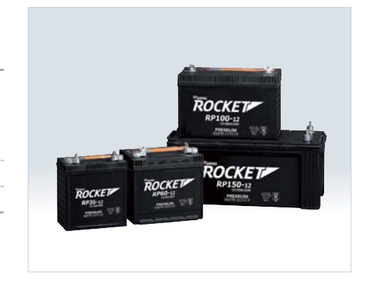
Uses : Electrical Panel, Generator, UPS system (Un-Interruptible Power Supply), Communication, Generator Startup, Fire Extinguishing System, Other Mechanical Equipment